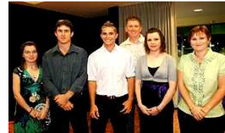
The finalist for the Rockhampton District finals held on May 2 at the Rockhampton Leagues

in Gladstone on 4 August at the Gladstone PCYC. Tickets on sale now. Visit www.qta.qld.gov.au to purchase your tickets today.