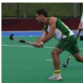
Jamie Dwyer in action at a coaching clinic