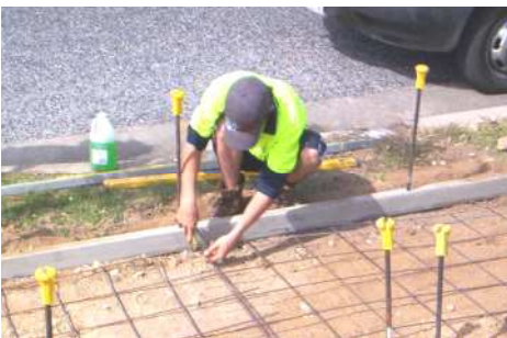
A CJP participant at Calliope Shire Council