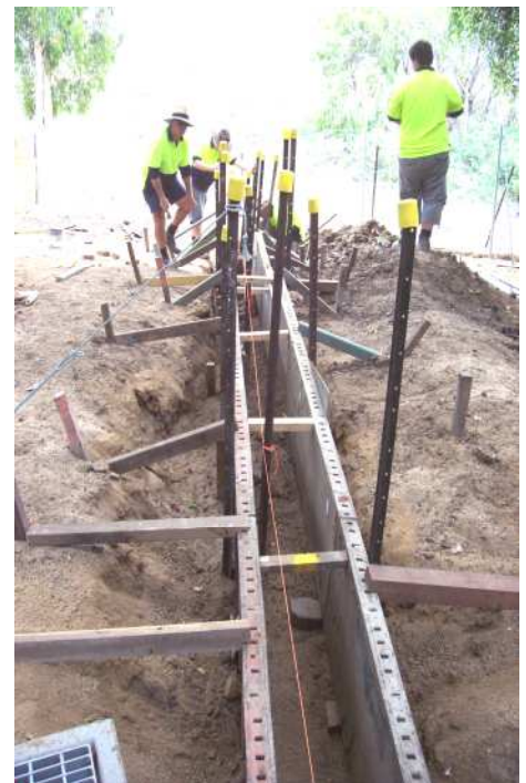
CJP participants at Rockhampton City Council